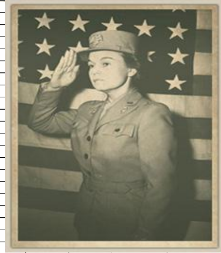
MASCOT : ROSIE THE RIVITEER OR A "WAC"